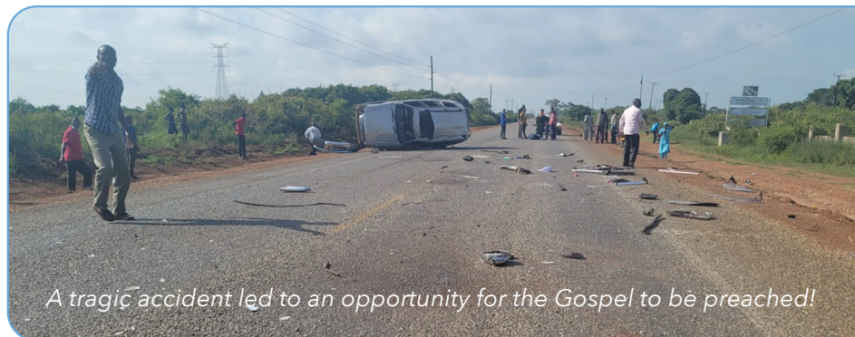
A tragic accident led to an opportunity for the Gospel to be preached!

On our way back from planting our new church in Serere, Uganda, we witnessed a horrific car accident directly in front of us on the highway. I told my driver to pull over and I jumped out and ran as fast as I could to the driver who was bleeding out on the pavement. It was clear to me that he probably only had moments left. I was not sure if he could hear me, but I knelt next to him and told him that Jesus died so that he could be forgiven and welcomed into Heaven. I pleaded with him to accept Christ. I cannot be sure if this was a coincidence but as I told him to put his hope in Jesus he turned and lifted his hand as much as he could. I can only hope that he was responding to the Gospel. I stayed with him praying until he was loaded into a car to be taken to the hospital. The police informed us later that they heard there was an accident and that the driver had died. I thank God for the opportunity to share Jesus with him one last time.