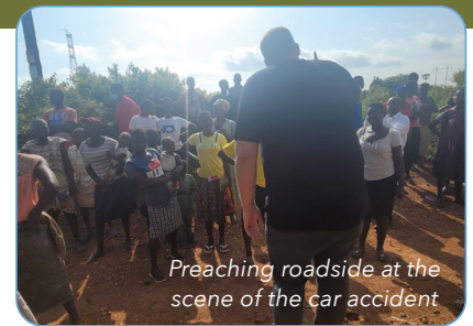
Preaching roadside at the scene of the car accident

I walked back to our car and my ministry partner in Uganda said, "We have to go let's get in the car." I replied, " You can get in the car I'm not done yet." The devil was not going to win. I stood up and asked for everyone's attention and preached the Gospel to about 50 people who were standing there. Many prayed to receive Christ. One of the team members took this picture as I was preaching to them. With so many amazing testimonies from this last trip it was hard to pick one. I chose this one to say that even in tragedy, the love of Jesus still prevails.