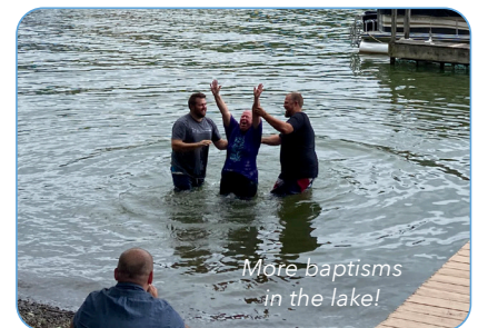
More baptisms in the lake!

This past May I was able to go on a 15-day mission trip to Uganda. I saw the hard work of Global Renewal firsthand. I saw the established churches that have been planted and the joy of the people. It was amazing to see the whole process of church planting. Securing the land, training the pastors, and putting the right people and resources in place, etc. I was able to participate in a Gospel outreach, where I saw people get physically healed and give their lives to Jesus! It was life changing to work with Global Renewal and experience the amazing things they are doing in Uganda!"