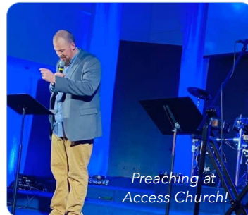
Preaching at Access Church!