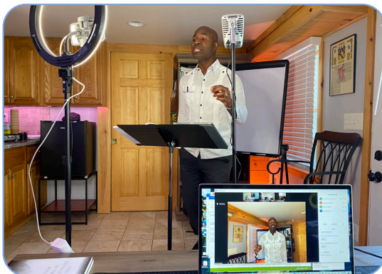
Round 2 of G.R.I.T.

Our work overseas has also continued to thrive! Becoming less necessary is one of the best feelings in the world to a leader. One of my greatest joys in 2020 and the beginning of 2021 was to see that our networks in Uganda and Nepal were able to plant new churches without me even coming to the country! One of the new churches that was planted in 2020 was in Sereni, Uganda. One of our pastors visited Sereni where he found that many of the people there were demonically oppressed. After the Lord set several people free in Sereni, people began to come to Christ! Now just a few months later they already have about 100 people gathering in Sereni! We are purchasing a piece of land for them this week so that they can begin to construct a church building. They are already making the bricks. The harvest is ripe and we at Global Renewal want to do everything that we can to reap the greatest harvest possible. Thank you for partnering with us to reach the world!