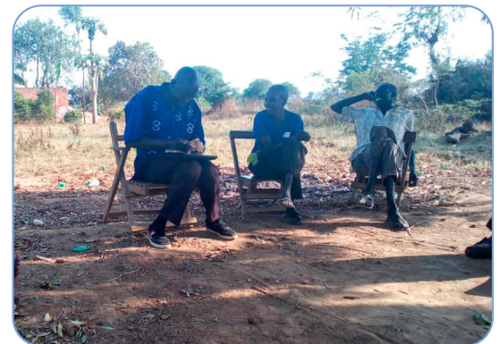
One of our pieces of land in Uganda waiting for a church!

A vision for the masses, a heart for the one.