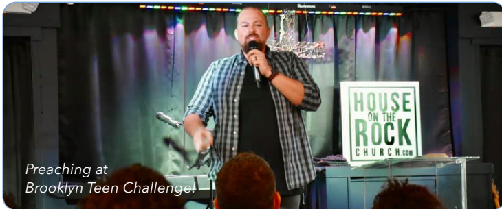
Preaching at Brooklyn Teen Challenge!