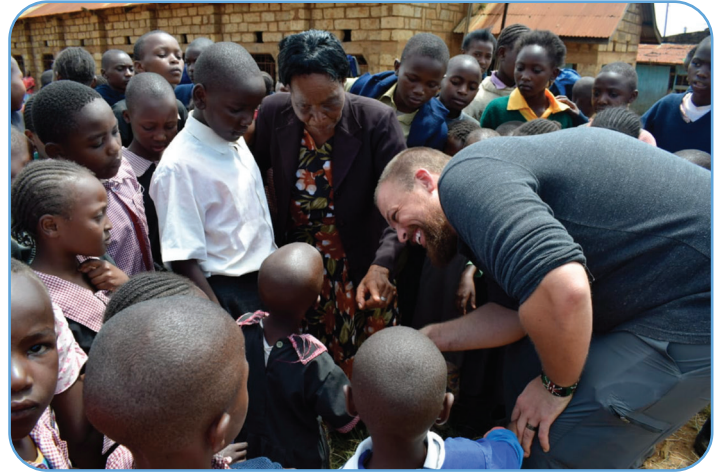
Visiting with students of our partner school near Mt. Kenya