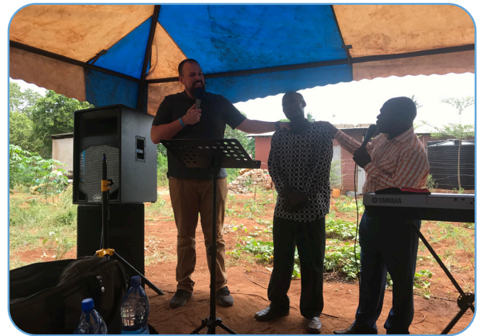
Commissioning the new pastor of the church!

Before we arrived, the building that we had planned to launch in was sold to another person, and we were left with nowhere to launch the church. However, during door-to-door evangelism, two of our team members had the opportunity to pray for the daughter of a Muslim couple who had been sick for a very long time. Her parents had brought her to other faith leaders and no one could help. When our team prayed over her she was instantly, totally healed! Her parents immediately offered us their land to build a church on! We quickly put up two tents so that we could begin services that week.