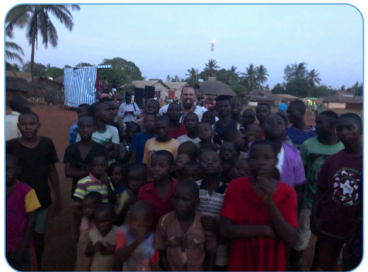
Two soccer teams received the Lord!