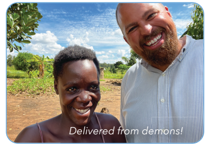
Delivered from demons!