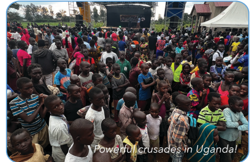
Powerful crusades in Uganda!

We are planning another trip to Uganda this January to plant a church and have a crusade in a majority Muslim area. As we go to bring in the harvest, we ask that you pray for us, and if God is calling you to go, please reach out to us and we would love to have you on a trip. Please also prayerfully consider sowing a seed into this incredible harvest!