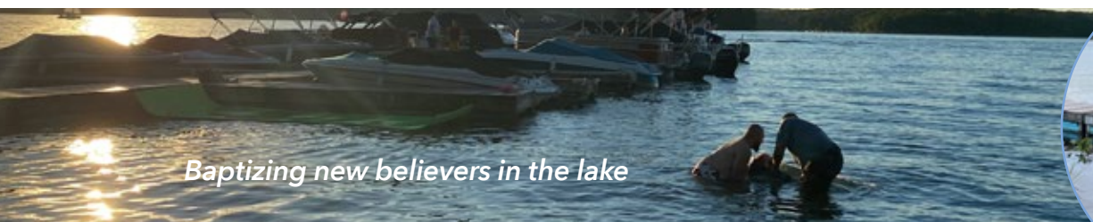
Baptizing new believers in the lake