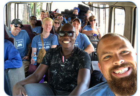
The team heading to Yumbe, Uganda

To plant the church, we built a team consisting of 14 people from the U.S., the three main leaders of our work in Kenya, and several native Ugandans. We experienced incredible unity as we followed God's lead, and everyone ministered powerfully in different ways. When we arrived in Yumbe, after a long and grueling trip, God opened amazing doors every day. We consistently had words of knowledge for the people we encountered, which lead to numerous amazing healings and salvations! Over the course of four days of ministry we saw about 100 people make decisions for Christ, many of whom were Muslim. We also saw close to 200 various healings and miracles during our outreaches in addition to the opening service of the church in Yumbe. The opening service was held in a tent because, due to flooding, our building was not yet finished. However, as I write this letter, the roof is going up on our building, on our own large piece of land - in Yumbe! Thank you all for your prayers and financial support, you made this possible!