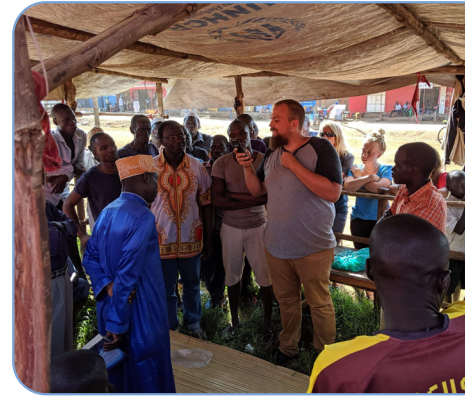
Preaching to the Imam