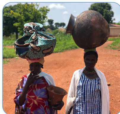
These 2 ladies received words of knowledge and were healed!