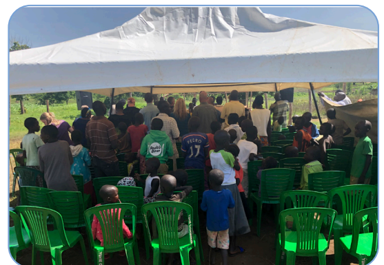
Opening service of the church

A vision for the masses, a heart for the one.